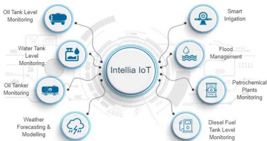
Figure 3 Applications of IoT

With Level Monitoring solutions, we can remotely monitor liquid level inside the tank/reservoir in real-time. These solutions allow us to access the fluid level information, temperature, and RH on mobile phones as well as desktops[5]. Using these solutions, you will be able to manage inventory effectively. The real-time visibility awareness of the days left in existing stock and theft for multiple locations at a time.